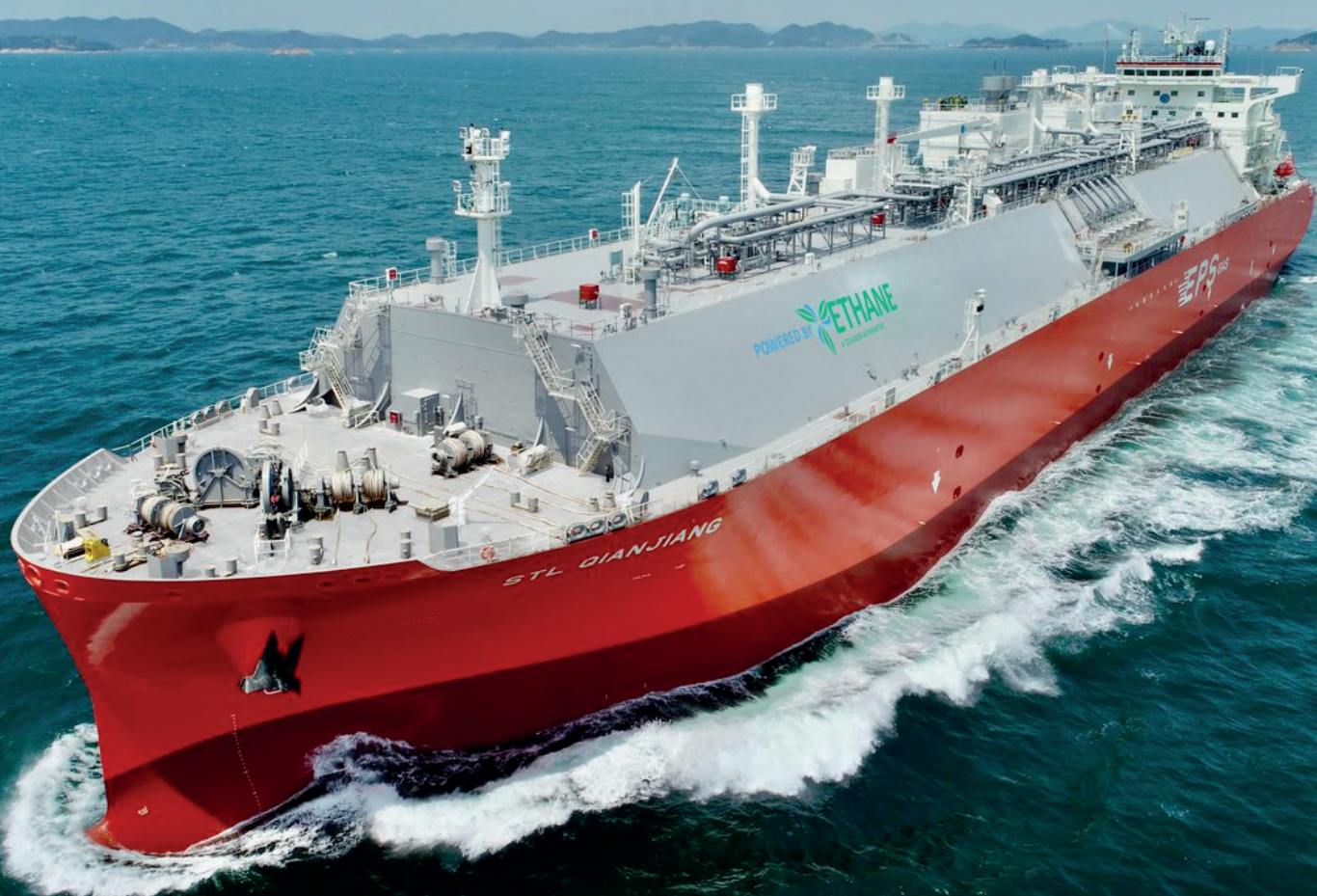
LPG Carrier (LPGC), STL Qianjiang , entered with The London P&I Club by Eastern Pacific Shipping Pte Ltd

The London P&I Club is committed to providing the best possible service to our Members. Delivering high calibre, responsive and sustainable support is fundamental to the way we work. We are part of the International Group of P&I Clubs where we play a key role in coordinating and promoting the collective strength of the P&I industry on behalf of the global ship-owning community.