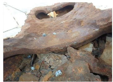
A container foundation's very poor condition makes it unserviceable