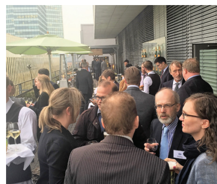
The successful event finishes with a reception for the more than 60 guests

"The excellent attendance at this, our first seminar in Germany, is consistent with the progress that our Club's German team has been able to make. We see a very strong overlap between the market's interest in quality, specialised P&I support and the Club's approach to our Members."