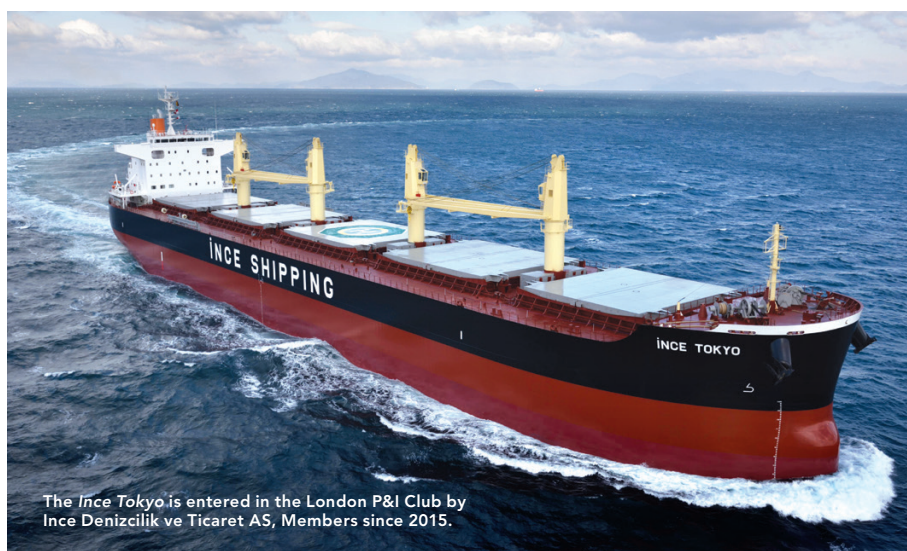
The Ince Tokyo is entered in the London P&I Club by Ince Denizcilik ve Ticaret AS, Members since 2015.

In the meantime, in mid-June we published the Club's 2016 Annual Report. On the financial side, this includes news of a challenging investment environment in 2015/16, but also a much improved underwriting result and an overall surplus for the year of US$3.3m. This lifted the Club's free reserve to US$160.7m – an all-time high at a time when we mark our 150 th anniversary. On the Membership side, the Annual Report also highlights growth in the Club's owned entry, along with progress in our charterers book of business and our recently launched P&I cover for owners of ships of up to 7,500gt. We have been very pleased to welcome business from existing and new Members in markets where the