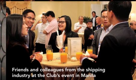
Friends and colleagues from the shipping industry at the Club's event in Manila