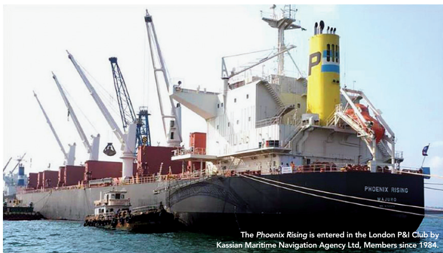
The Phoenix Rising is entered in the London P&I Club by Kassian Maritime Navigation Agency Ltd, Members since 1984.

The Annual Report also looks at how the Club works to build on its central objective – the delivery of specialised P&I and FD&D support from a strong financial base – through a high level of engagement with our Members in addition to our day-to-day work. An example of this involves the Club's loss prevention output, most recently