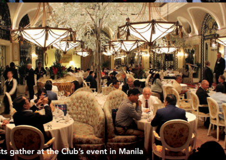
Guests gather at the Club's event in Manila