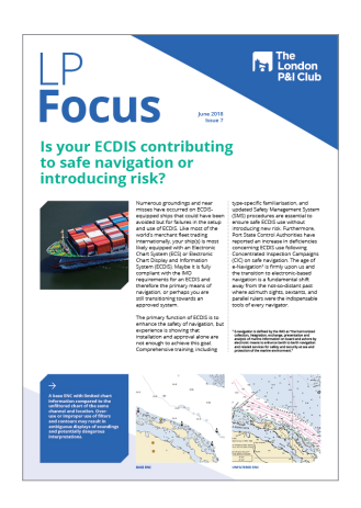
LP Focus Click to download

A well-structured SMS policy and a good quality type-specific training programme are encouraged to avoid navigational safety shortcomings caused by the introduction of technology which ought to enhance safety.